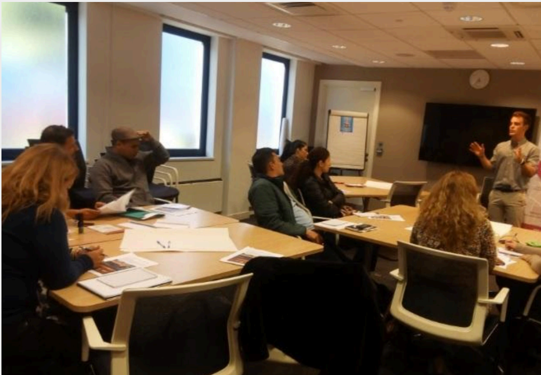
Photo 1: Traders at a migrant and ethnic business readiness workshop in partnership with Bridging to the Future, 2017

In order to achieve social justice, our approach has focused on stimulating agency among those people who are affected and negatively impacted by the development. Listening to their voices and amplifying these was important and strategic; but more so was encouraging their participation in planning forums and strategic meetings with local government officials, elected members