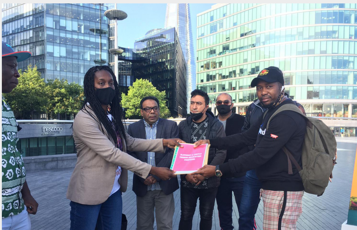
Photo 2: Market traders delivering alternative sites for outdoor market pitches - October 2020

successfully overcoming many hurdles. We have heard numerous distressing accounts of the challenges of migration and settlement. Many challenges have revolved around making ends meet and securing an income in multiple low-paid and low-skilled jobs with exploitative working conditions. A large majority of BAME traders started out in the cleaning industry - with no employment rights, no contractual sick pay, and a lack of dignified and safe conditions - being paid less than the London Living Wage. Starting their own businesses has often been described as a journey from humble beginnings to self-empowerment. From daily 4am starts in the cleaning sector to running a successful business, generating employment, serving the community and being an integral element of multicultural Southwark and London.